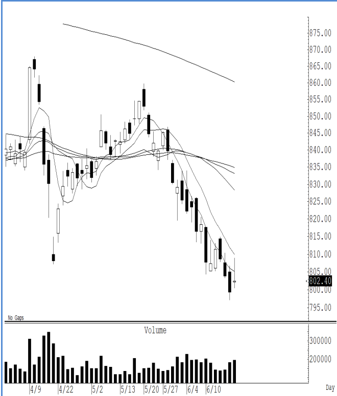
S50M24 (Close 802.40 Chg 3.0)